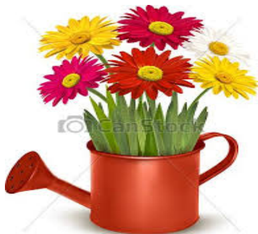
© Can Stock Photo - csp14307010

We will be wrapping up our Beatitudes year of growing closer to Jesus with a cool project and lots of goodies. Everyone is welcome!!!!